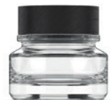
INFUSION 50 ML JAR WOOD 45/400 CAP