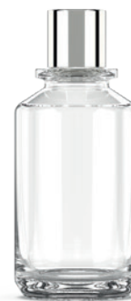
INFUSION 200 ML BOTTLE TWENTY CAP