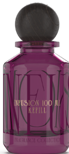
INFUSION 100 ML REFILL BALL WOOD CAP