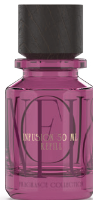
INFUSION 50 ML REFILL KOPOY WOOD CAP