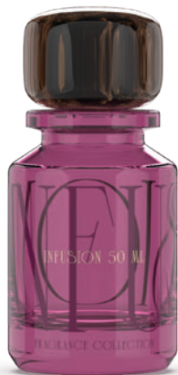
INFUSION 50 ML SOPOY CAP