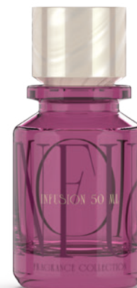
INFUSION 50 ML KOPOY CAP