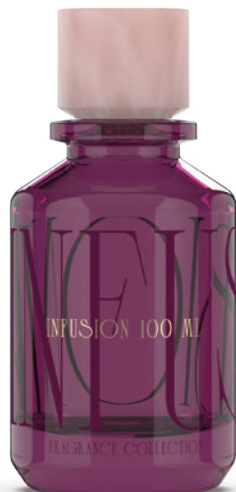
INFUSION 100 ML KOPOY CAP