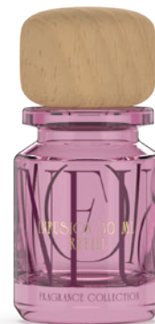
INFUSION 30 ML REFILL SOPOY WOOD CAP