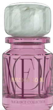
INFUSION 30 ML SOPOY CAP