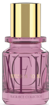
INFUSION 30 ML JMP CAP