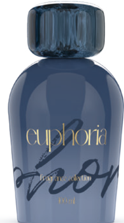
EUPHORIA 100 ML SOPOY CAP