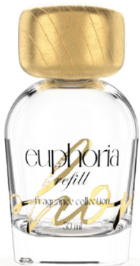
EUPHORIA REFILL 50 ML SOPOY WOOD CAP