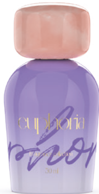
EUPHORIA 50 ML SOPOY CAP