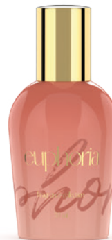
EUPHORIA 30 ML ALU CAP