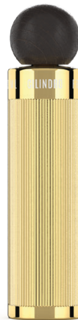
CILINDRO 100 ML BALL WOOD CAP