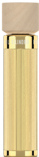
CILINDRO 50 ML KOPOY WOOD CAP