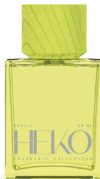
HEKO REFILL 50 ML KOPOY WOOD CAP