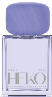
HEKO REFILL 30 ML SOPOY WOOD CAP