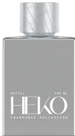
HEKO REFILL 100 ML KOPOY WOOD CAP