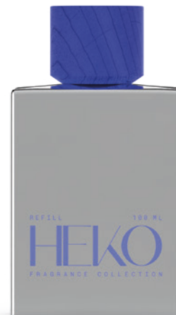
HEKO REFILL 100 ML KOPOY WOOD CAP