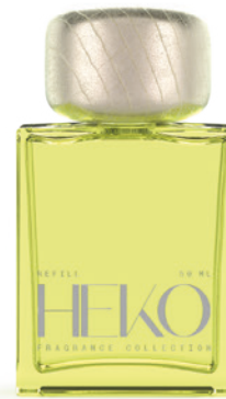
HEKO REFILL 50 ML SOPOY WOOD CAP