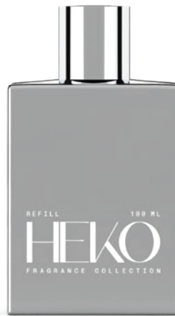
HEKO REFILL 100 ML CYLINDRICAL CAP