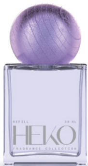
HEKO REFILL 30 ML BALL WOOD CAP