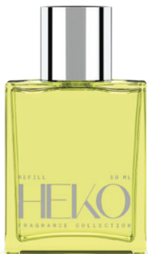
HEKO REFILL 50 ML CYLINDRICAL CAP