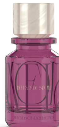
INFUSION 50 ML KOPOY CAP