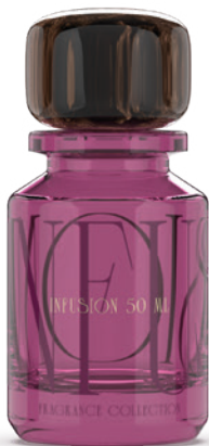
INFUSION 50 ML SOPOY CAP