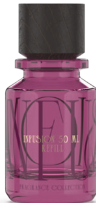
INFUSION REFILL 50 ML KOPOY WOOD CAP