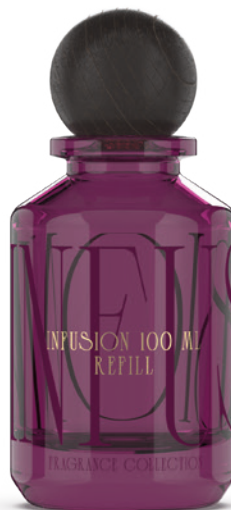
INFUSION REFILL 100 ML BALL WOOD CAP