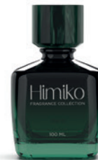
HIMIKO 100 ML BOTTLE KOPOY CAP