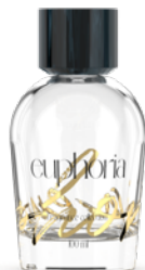
EUPHORIA 100 ML BOTTLE KOPOY CAP