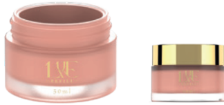
Outside: frosted Inside: shiny | matte varnishing