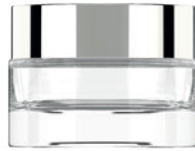
LUXE 50 ML JAR GIROTONDO 60/400 CAP