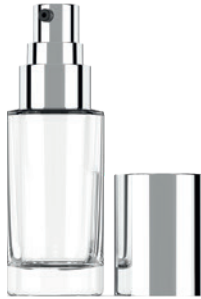
LUXE 30 ML BOTTLE URBAN LUXURY 35 CREAM PUMP