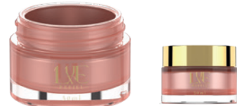
Outside: transparent Inside: special varnishing