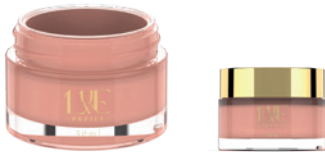
Outside: transparent Inside: shiny | matte varnishing