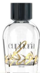
EUPHORIA 100 ML BOTTLE KOPOY CAP