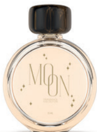
MOON 75 ML BOTTLE SOPOY CAP

Kopoy & Sopy caps adapt to a wide variety of bottles with different design. Discover all the matches!