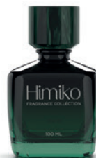
HIMIKO 100 ML BOTTLE KOPOY CAP