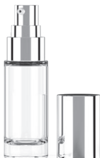
SKY 20 ML BOTTLE URBAN LUXURY CREAM PUMP 30