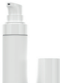
SKY 30 ML BOTTLE MAKY CREAM PUMP